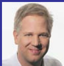
The Glenn Beck Show M-F 10a-12n